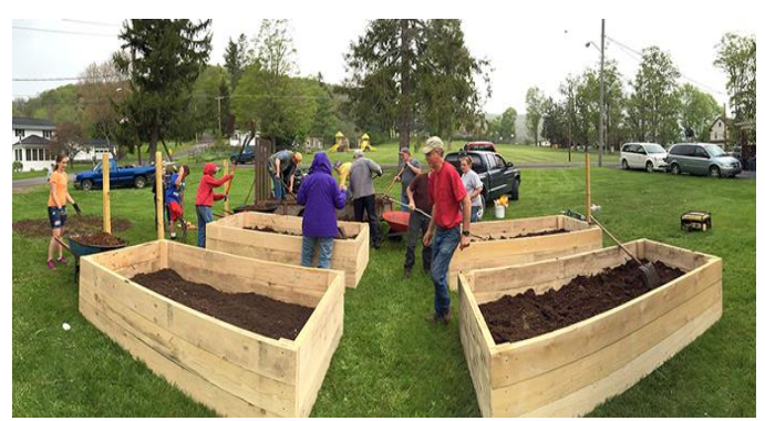
Raised beds are filled with soil for the first season of planting in Bloomville in the Catskills.